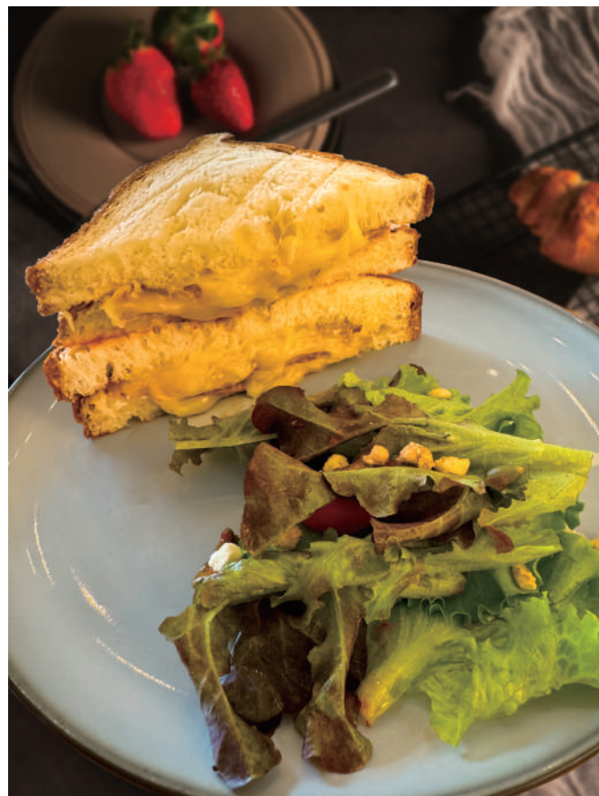
Ham And Cheese Sandwich